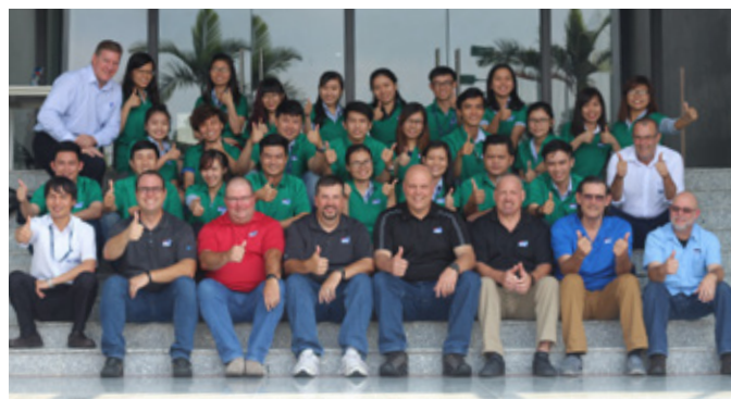
BMC team visited our company in 2017