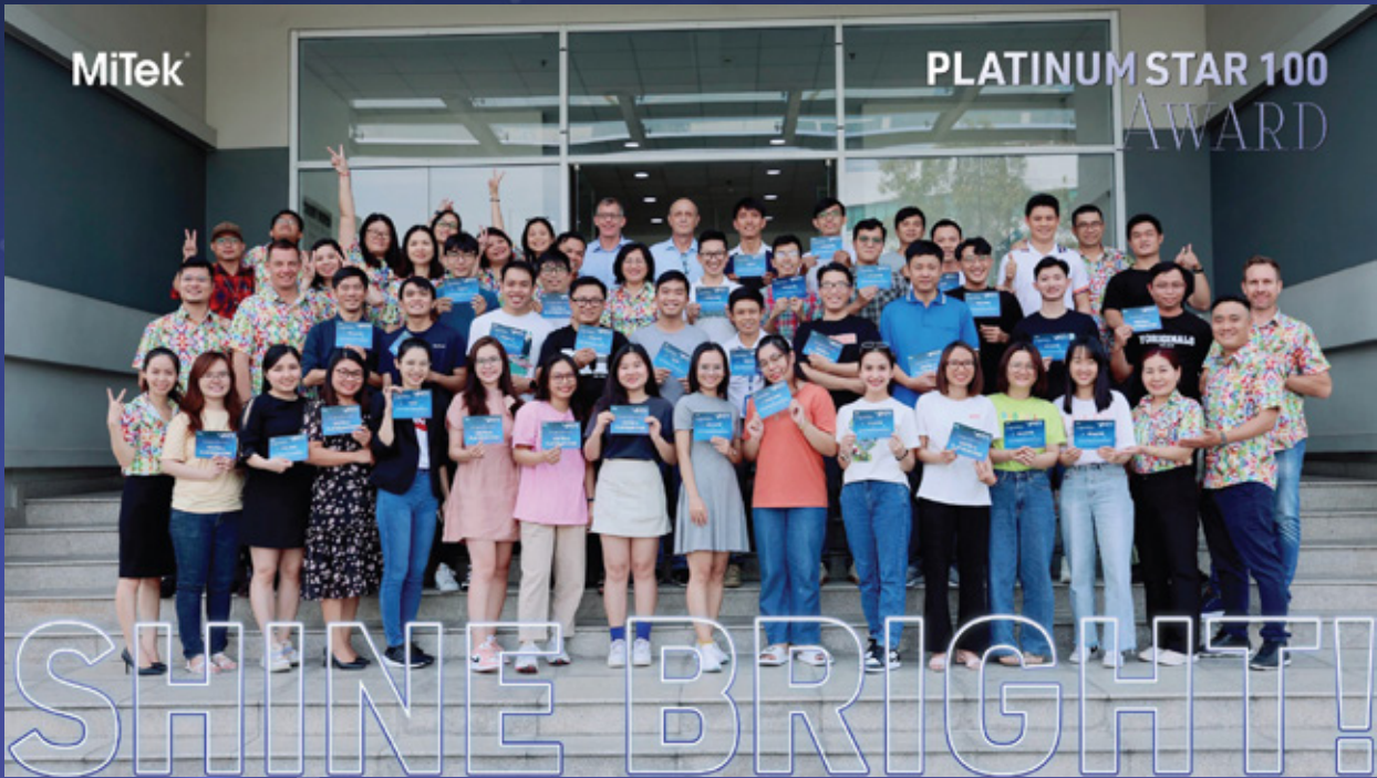
Office 3 & 4