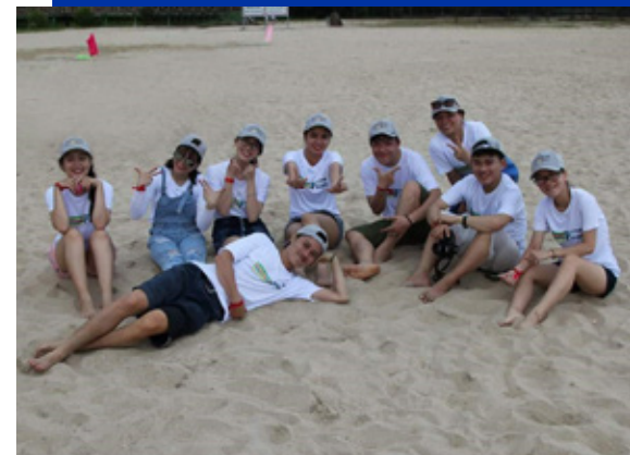
• In the company trip