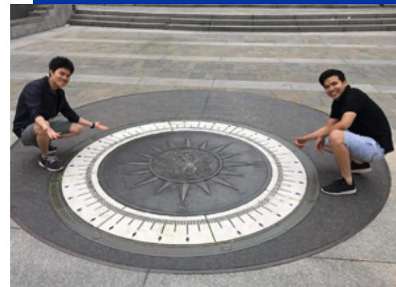
• In the training trip