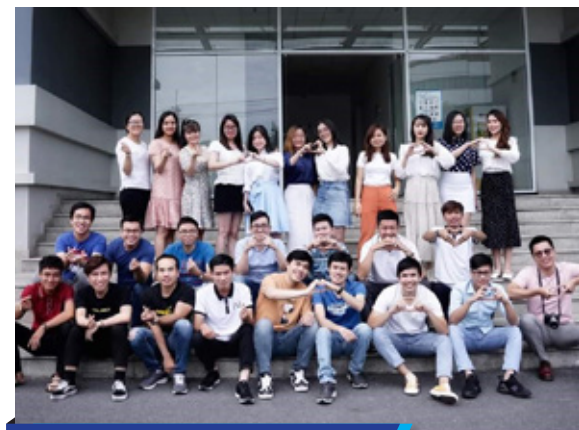
• With my team in front of the office 3