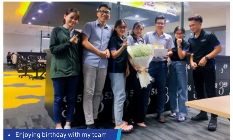
• Enjoying birthday with my team

"I've been on a lot of great vacations. The best vacations are with my friends at MiTek. Whether they are short, like a quick trip to Can Gio beach or a long trip like a three days trip to Ninh Thuan or Da Lat City, vacations are always better with my friends. Among my most memorable were the trips by motorbike with my husband (he's on 4th Floor)."