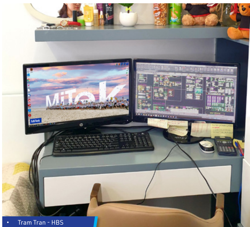
• Tram Tran - HBS