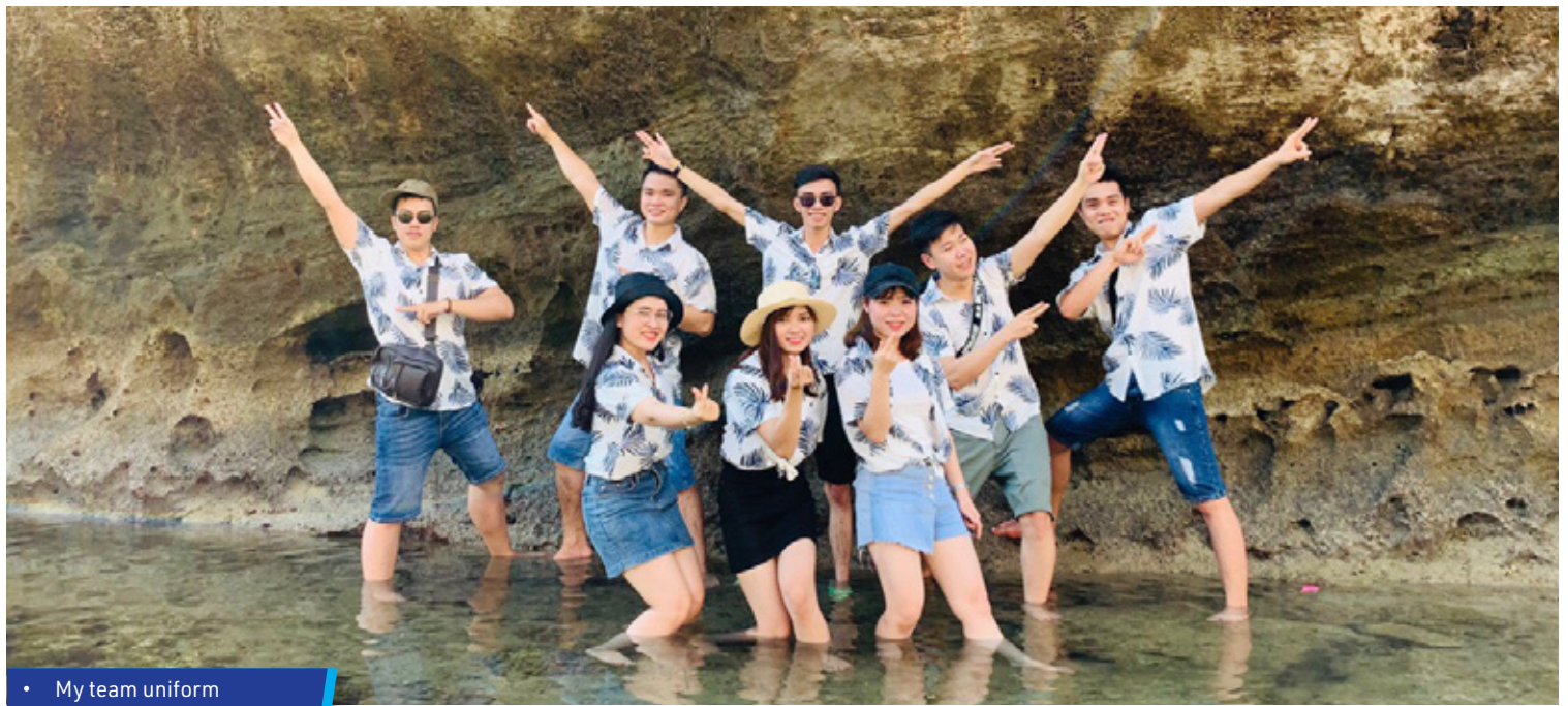
• My team uniform

I am a kitchen designer, and I love what I do. I began in MiTek back in 2016, enjoying every moment of it. I like to push myself into doing more and doing it better every day. Some incredible teachers are showing me how to get things done. Pre-COVID19, I was pretty good at managing my time between work. And my favorite hobbies as Yoga and the gym. That seems ages ago now. I am more than ready to get back and super excited to see how I can grow in MiTek.