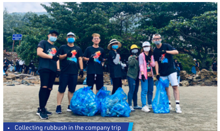
• Collecting rubbish in the company trip

"I believe MiTek will continue to grow over the years."