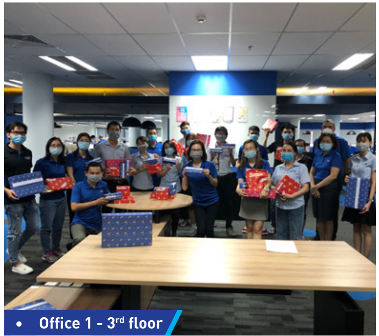
• Office 1 - 3 rd floor