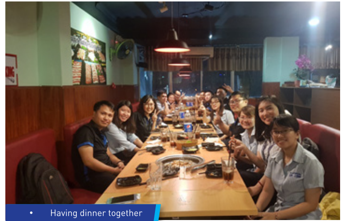
• Having dinner together

So let me tell you about my team – Metricon Homes. The Metricon team feels like my second family. We always work and play together. We have shared experience and make memories together and I have learned key soft skills and social skills from them.