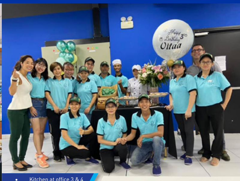
• Kitchen at office 3 & 4