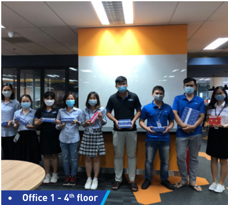
• Office 1 - 4 th floor