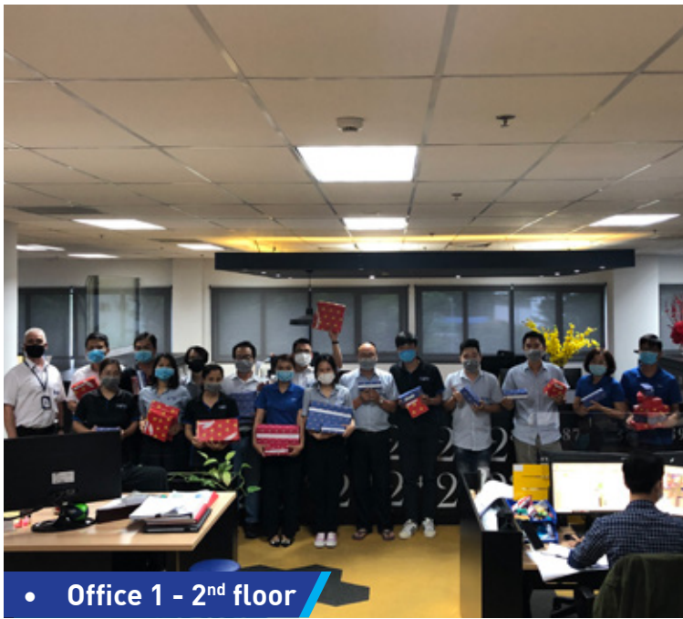
• Office 1 - 2 nd floor