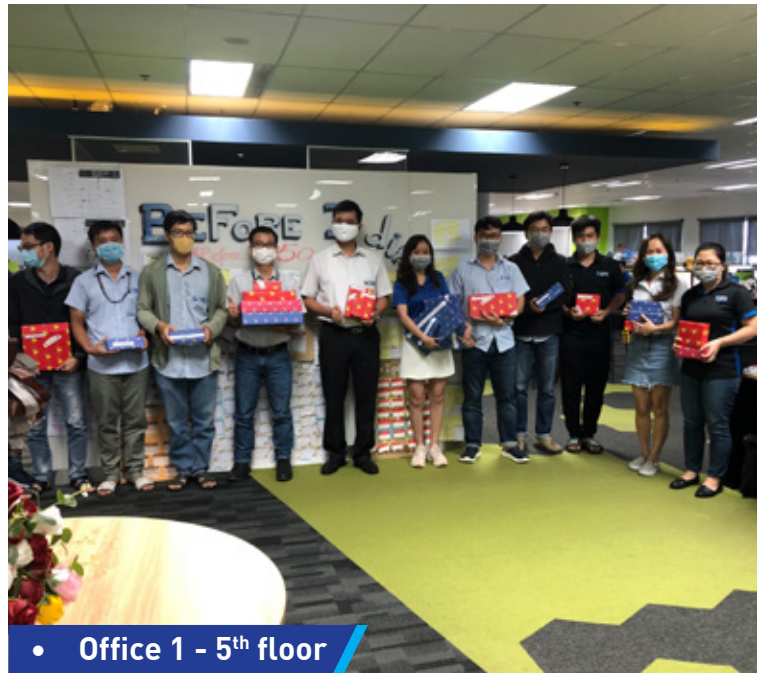
• Office 1 - 5 th floor