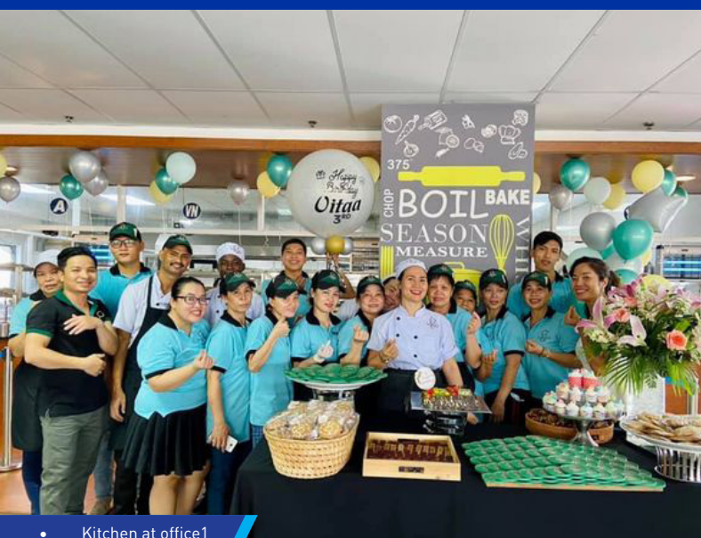
• Kitchen at office1