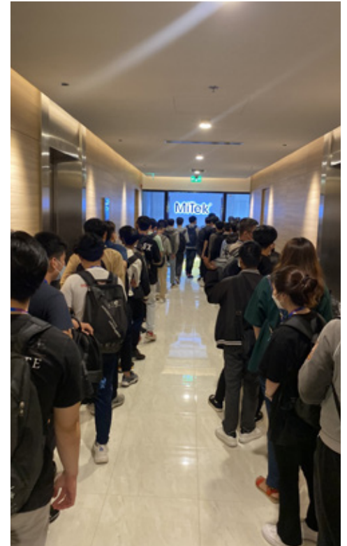
Office tour for 53 students with Software major's from Ton Du Thang University – 16 th September