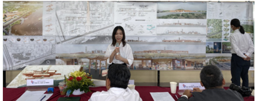
Ceremony of Business Connection & Graduation Thesis Defence for 42 students from the Architecture Faculty of Ton Duc Thang University